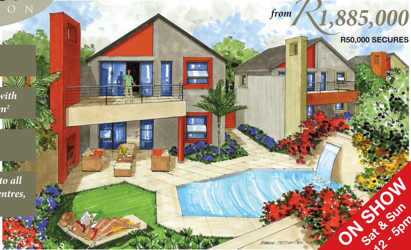
Artist's impression - Selling off plan. Pool and braai optional extras.

In the heart of Bryanston close to all amenities - schools, shopping centres, gyms, Bryanston Country Club